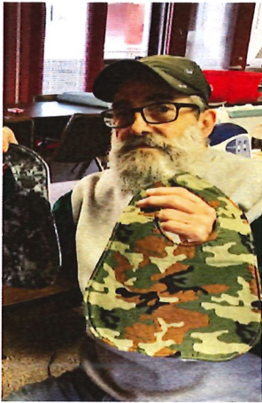
Stanley at Tatakot